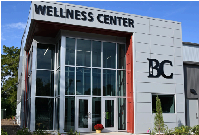
Wellness Center Completed in 2025

2025 saw the end of our Engage the Future capital campaign, concluding with the opening and dedication of our brand new Wellness Center. Without missing a beat, we launched the Foundations Strong and True capital campaign in January of 2026. The cornerstone of this campaign will be renovations to Haury Hall, our oldest dormitory which currently serves as housing for our freshmen.