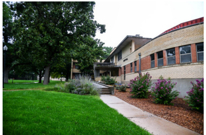
Haury Hall Completed in 1958