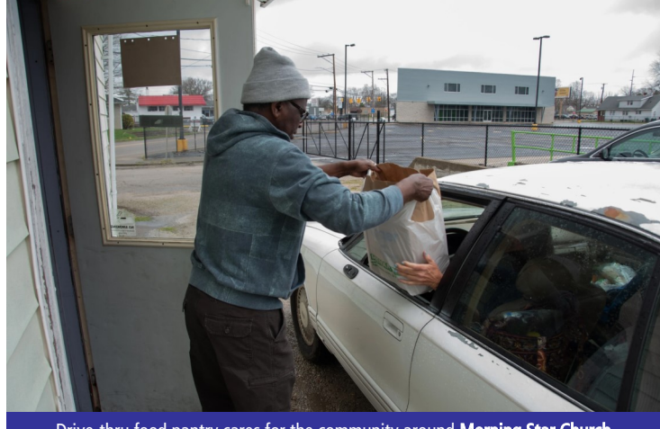
Drive-thru food pantry cares for the community around Morning Star Church.

Church (Goshen) share their space with childcare organizations from Monday to Friday. Belmont recently started sharing their building with New Generation Child Care Ministry, a ministry of New Beginnings United Worship Center. They offer childcare services to members of the community, including school drop-off and pick-up. College has a longstanding relationship with Campus Center for Young Children, which provides full- and part-time care and programming for children from 12 -months to 5 years old.