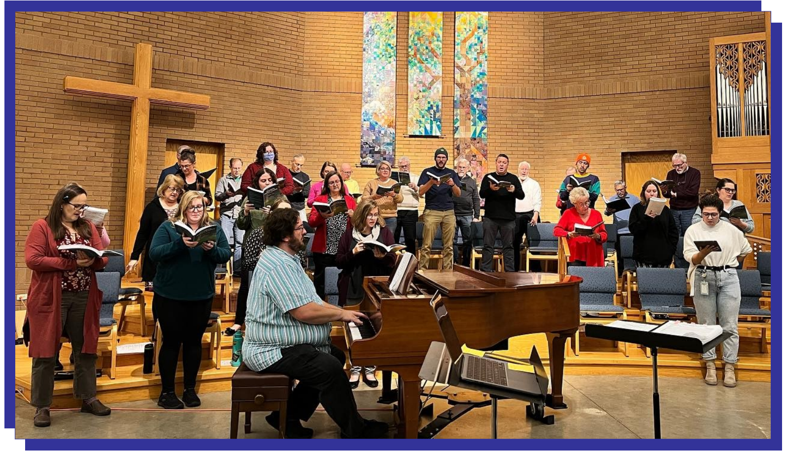
Musical Arts Indiana Vesper Chorale rehearsing at Kern Road Mennonite Church.