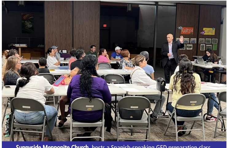
Sunnyside Mennonite Church hosts a Spanish-speaking GED preparation class

Kern Road Mennonite Church (South Bend) is host to the Swanee Area Council of Pastors and the Hudson group regional meetings in addition to being the rehearsal and performance space for the Vesper Chorale of Musical Arts Indiana, South Bend. They also open their space for